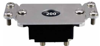
19A-P21-N-xxx Series Automatic Reset T1 Wide Mounting Bracket Natural Finish