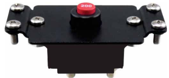
19M-P21-B-xxx Series Manual Reset TIII Wide Mounting Bracket Black Finish Option