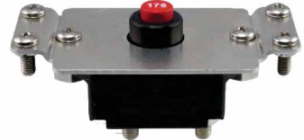
19M-P21-B-xxx Series Manual Reset TIII Wide Mounting Bracket Natural Finish