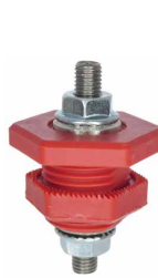
Panel Cutout Ø 22.1mm