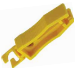
Cartridge Fuse Pullers (see p.44)