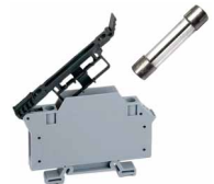
Fused Terminal Blocks (see p.149)