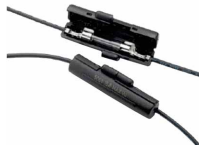
Inline Fuse Holders (see p.69 - 71)