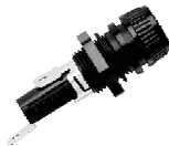
Panel Mount Fuse Holders (see p.69)