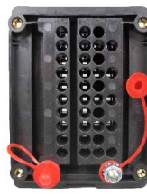
Rear of Block

Left Stud Right Stud Stud Cover (Fitted) Connect supply cables to power input studs (80A max. each)