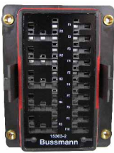
Front of Block

5 circuits powered by Right stud 10 circuits powered by Left stud